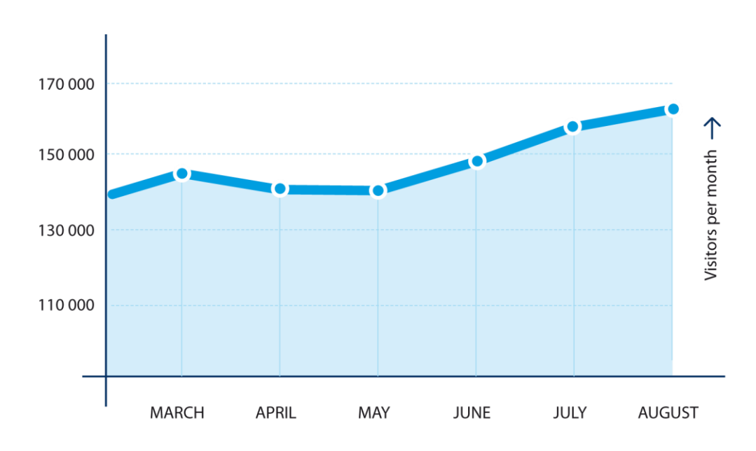
Chart based on FXstreet.cz portal's visits in 2023